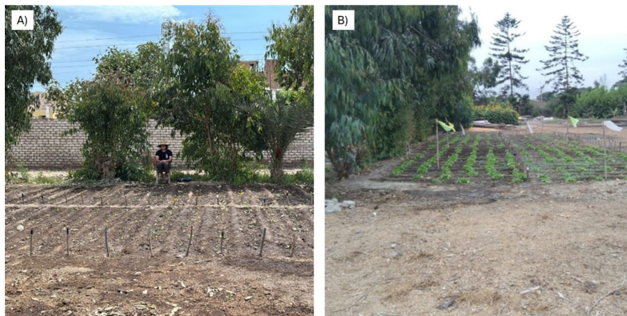
Fig. 2 A) Overview of the experiment field in early January 2025 immediately after the beginning of the experiment, and B) Overview of the experiment in late January 2025 just prior to harvest and completion of the experiment

portion of the plants (the commercially valuable portion of the plant) was collected and weighed to determine yield. The treatments were: