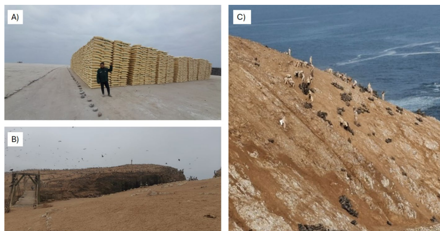
Fig. 1 A) Bags of guano de isla ready for distribution, B) Overview of a guano de isla Island, C) Workers harvesting guano de isla

Eight experimental treatments were established using a randomized complete block design, each replicated ten times (Fig. 2). Each experimental replicate contained six lettuce plants ( Lactuca sativa ) spaced 55 cm apart. The lettuce seedlings were transplanted into the experimental plot two weeks after sowing in cultivation trays. Irrigation was applied every four days, and weed control was performed during the third week following crop establishment. Harvest took place in the fifth week, during which the foliar