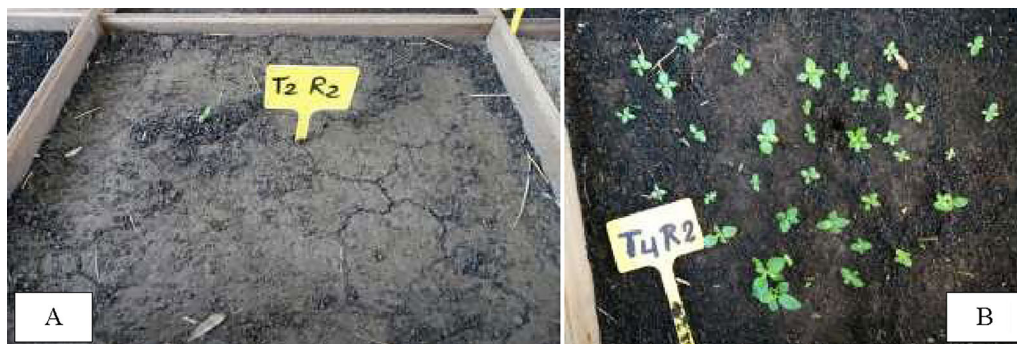
FIGURE 1 Emergence of plants Calycophyllum spruceanum from in substrate (A) soil alluvial (T2) and (B) substrate with organic matter (T4).

that it retains excess moisture. Therefore, Hernández et al. (2014) propose that 30% and 50% sawdust should be used in a substrate, or in any case avoid its use and look for other alternatives.