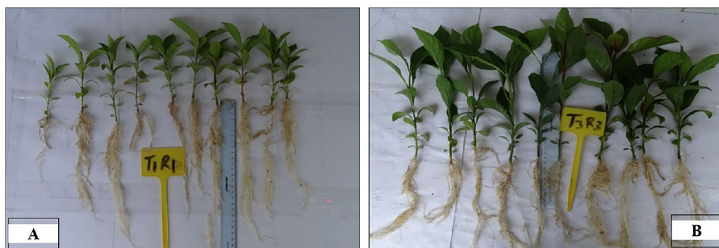
FIGURE 2 Calycophyllum spruceanum plants were produced in (A) control substrate and in tube (T1) and in (B) carbonized rice husk (CRH) + chicken manure in bag (T3).

Note: Equal lowercase letters in the column and uppercase letters in the line do not significant statistical difference, according to the Tukey's test at 1% probability. Abbreviation: CRH, carbonized rice husk.