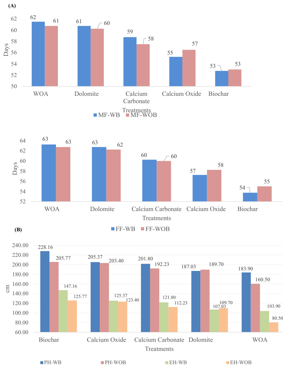
Fig. 2. Effect of the interactions of amendment use with (WB) and without (WOB) B. subtilis application on the variables (A) days to male flowering (MF) and female flowering (FF), and (B) plant height (PH) and ear height (EH). WOA means without amendments. Means with different lowercase letters indicate significant statistical differences, as determined by Tukey's test at a 0.05 significance level.

green forage yield (GFY) and dry matter yield (DMY) show more moderate correlations, indicating a less direct interaction between these variables and growth characteristics.