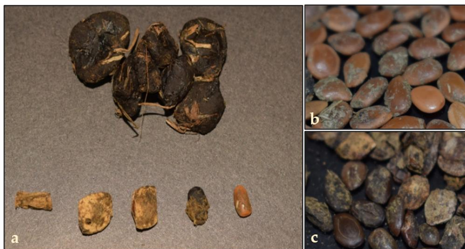
Figure 1. (a) Fragments and seeds recovered from WTD dung, (b) Appearance of seeds considered for the germination experiment. (c) Seeds in the process of germination, with signs of inhibition and darkening.