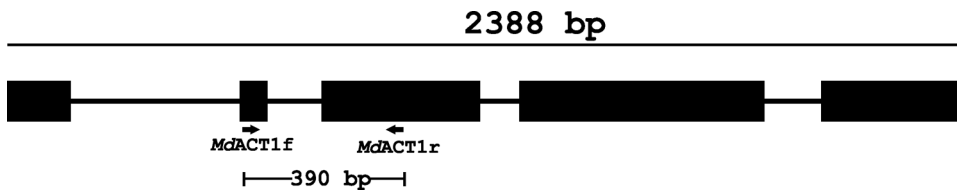
FIGURE 1 ACT1 gene structure of Arabidopsis thaliana homologue showing its exons (filled boxes) and introns (lines). Likewise, the areas of hybridization of the degenerate primers (arrows). The image was designed based on the coded sequence NC_003071.1 from the NCBI gene bank.

Full-length mRNA sequences of the actin 1 genes of Arabidopsis thaliana (NM_179953.2), Populus trichocarpa (XM_002298674.1), and Vitis vinifera (XM_002282480.1) were obtained from the Gene Bank database of the National Center for Biotechnology Information (NCBI). These sequences were aligned with the Clustal W2 software and degenerate primers designed with the SC Primer software [13] in a manner such that at least one of the primer pairs spanned an intron–exon junction. Where this was not possible, primers were designed to lie on either side of an intron splice site. Primer design specifications were: an amplicon size of 200 to 400, optimum primer length of 20 to 22 bp, primer T_m of 59 to 65 ^{\circ}\text{C} , allowed T_m difference 3 ^{\circ}\text{C} , and primer GC% of 45% and 55%, with all other parameters left at default. The primers selected from the results primer table were MdACT1f : 5'-TYGTYTGYGACAATGGAAC-3' and MdACT1r : 5'-ATTGTAGAAWGTGTGATGCCAA-3', which hybridized in exon 2 and 3, respectively, of the homologue gene of A. thaliana and flanking intron 2 (Figure 1). Expected product size was 254 bp for cDNA and 390 bp for genomic DNA.