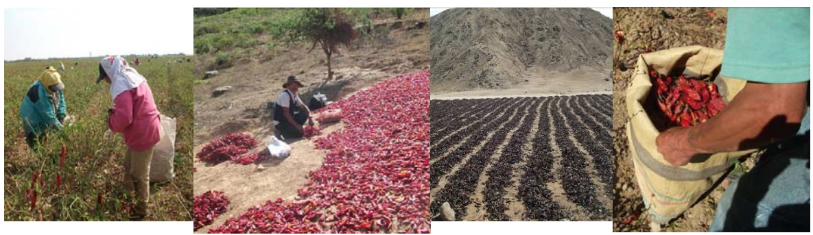
Fig. 1: Examples of dried capsicum production processing in Bolivia and Peru.